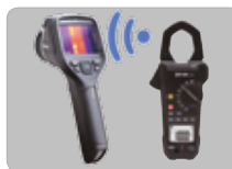
Bluetooth® METERLiNK® communication