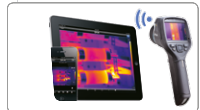
FLIR Tools Mobile Wi-Fi connectivity