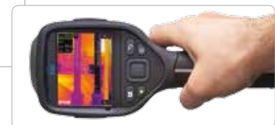
Auto-orientation keeps diagnostics overlays upright