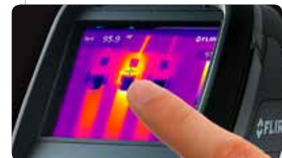
Large 3.5" touchscreen