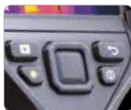
Large buttons for easy glove-handed operation