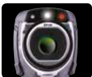
Visible light pictures align with thermal images: 3.1MP digital camera, LED lamp, and laser pointer