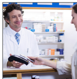
Payment Processing Systems