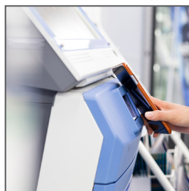
Airline Ticketing Systems