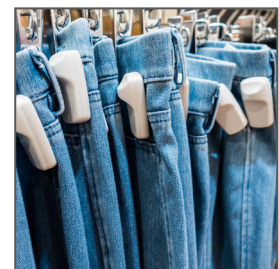
Apparel Tagging Readers