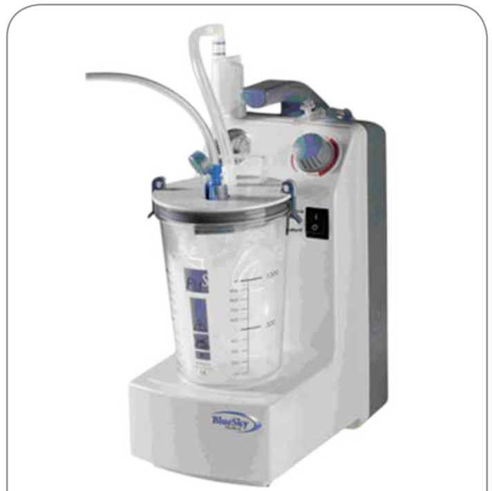
Wound therapy

Customer Benefits: Maintains proper level of pressure so that the firmness can be controlled regardless of the patient's weight. The proper control of the pressure improves patient comfort. Additionally, by helping to facilitate alternating the pressure in the different zones of the mattress, the incidence of bedsores can be reduced. It has been found that by creating different zones in the bed and by alternating the pressure in the various zones, the pressure points experienced by the patient can be varied, which helps prevent bedsores in patients that use the bed for extended use.